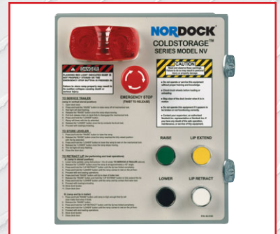
Optional LOGI-SMART™ Integrated Control Systems