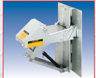
Available TRUCK-LOCK® Safety Systems