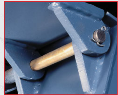
EXCLUSIVE LIP LUG & HEADER PLATE DESIGN