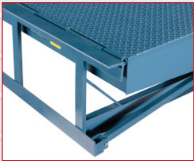
FULL WIDTH REAR HINGE WITH ZINC PLATED ROD