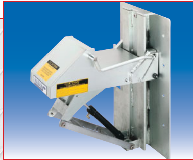
AVAILABLE TRUCK-LOCK® SAFETY SYSTEMS